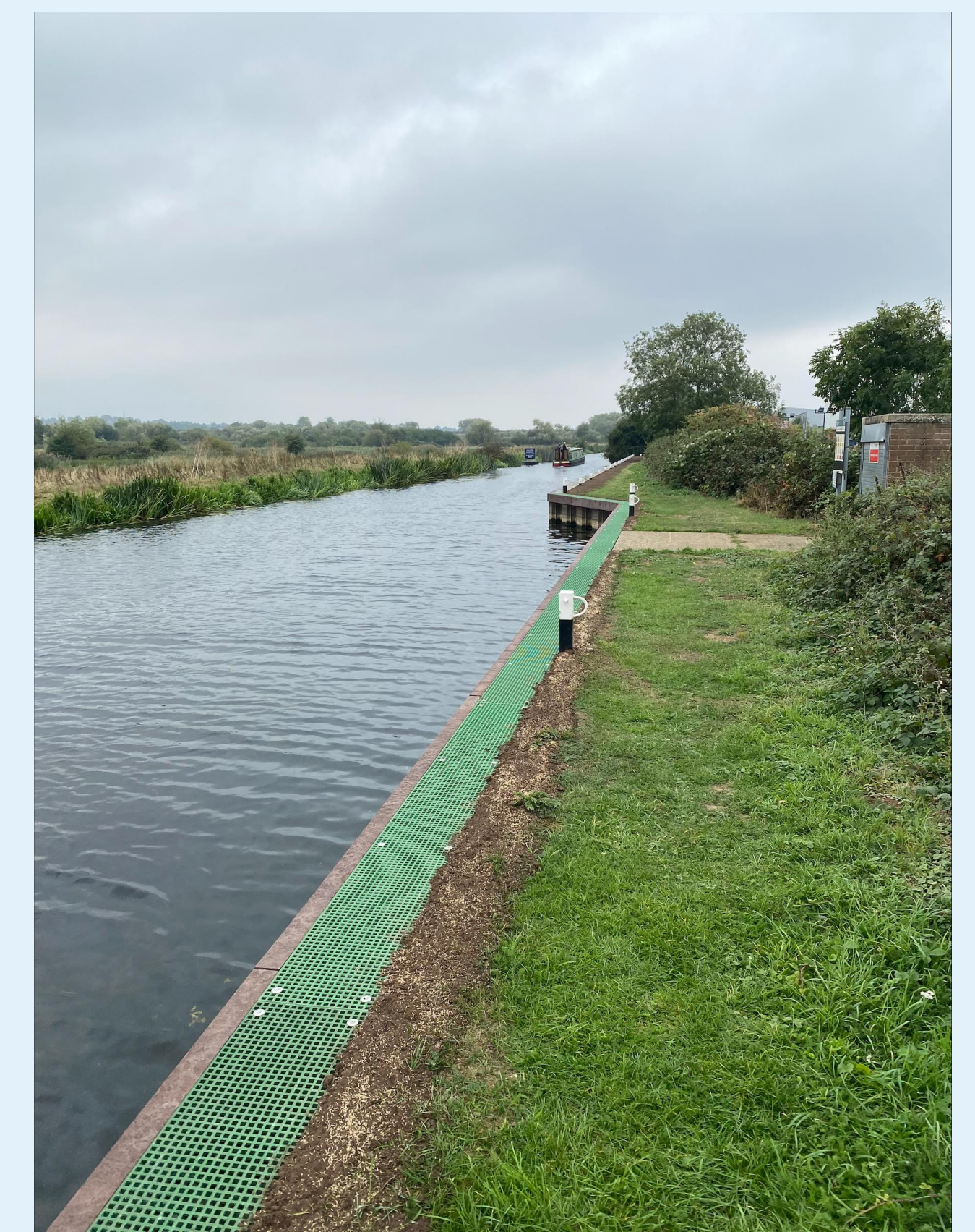
Mooring frontage at Irthlingborough

We are pleased to have completed refurbishment of 100m of mooring frontage at Irthlingborough on the river Nene, enhancing the experience for all users'.