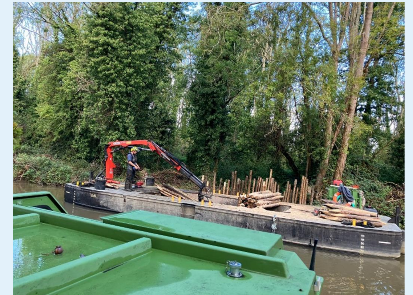
Bank stabilisation work from the river

The repair involved the use of locally sourced chestnut stakes to stabilise the bank at the breach site. Local willow rods were planted to further bind and stabilise the bank.