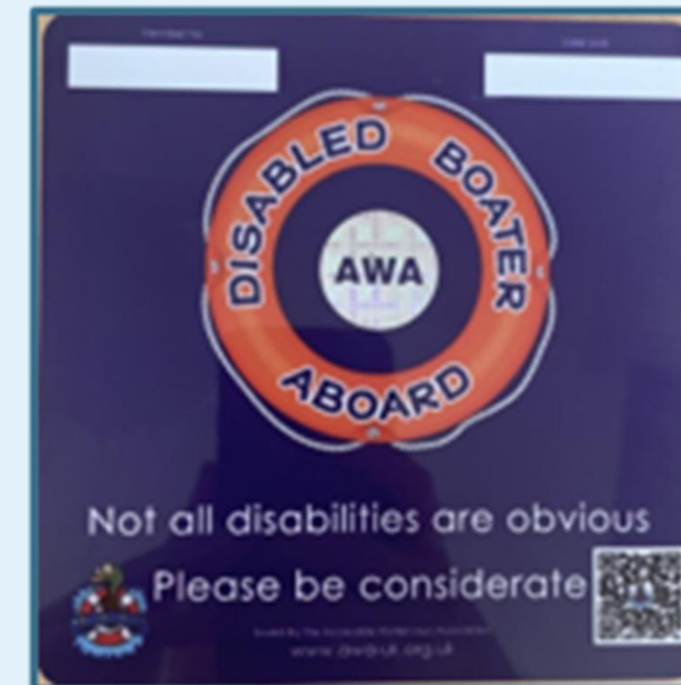
AWA 'blue badge'

Following our meeting we took a tour of the moorings and the site, as well as discussing areas that could benefit from improvements to enhance accessibility. We would like to thank AWA for their time. If anyone would like to arrange a meeting with us, please contact us on waterwaysanglian@environment-agency.gov.uk