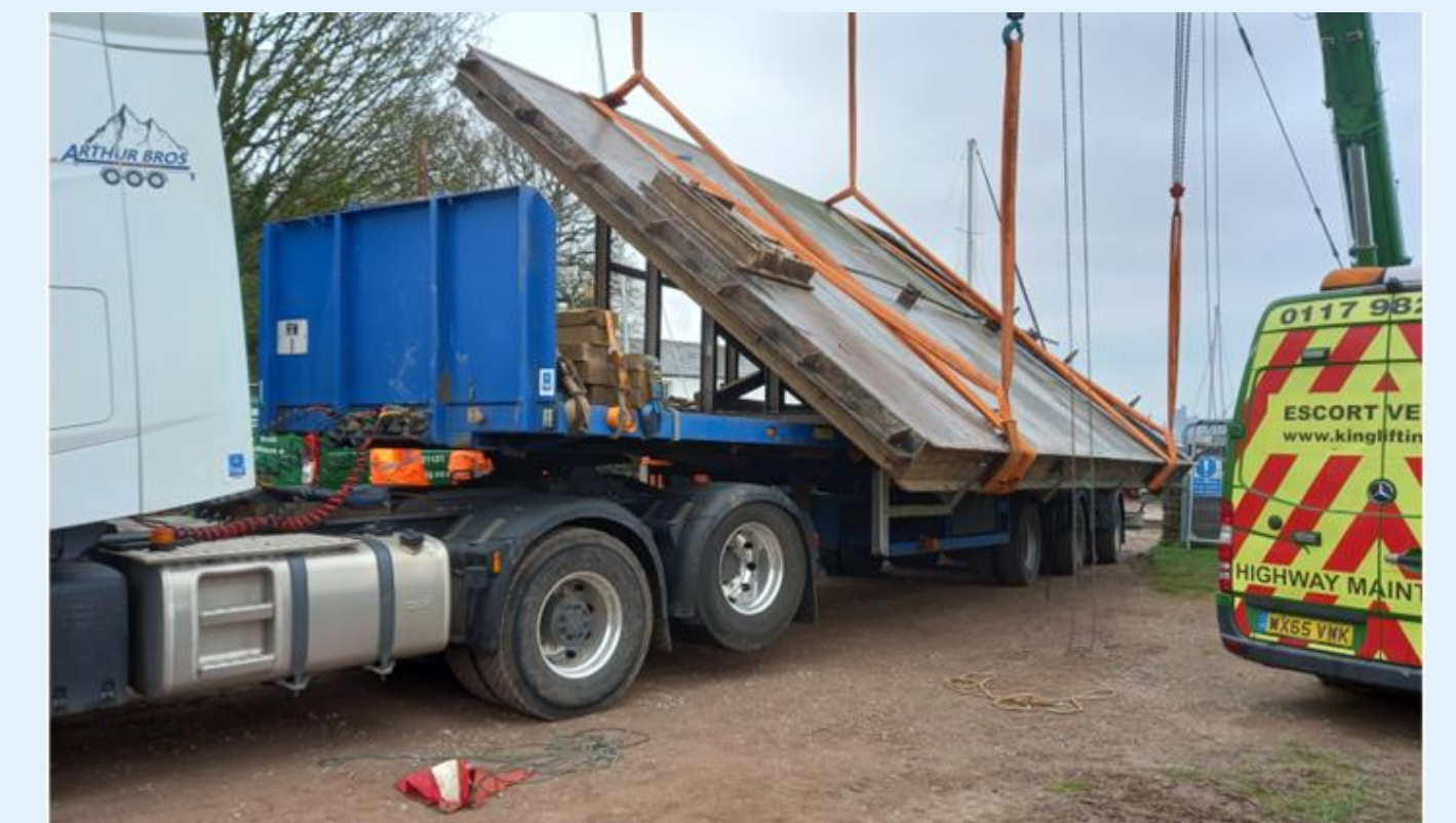
Sea gate being craned off the transporter

Our Navigation Team have also delivered significant inner harbour works with new mooring points installed and vegetation management. All works were completed in our role as landowner and Statutory Harbour Authority for Lydney.