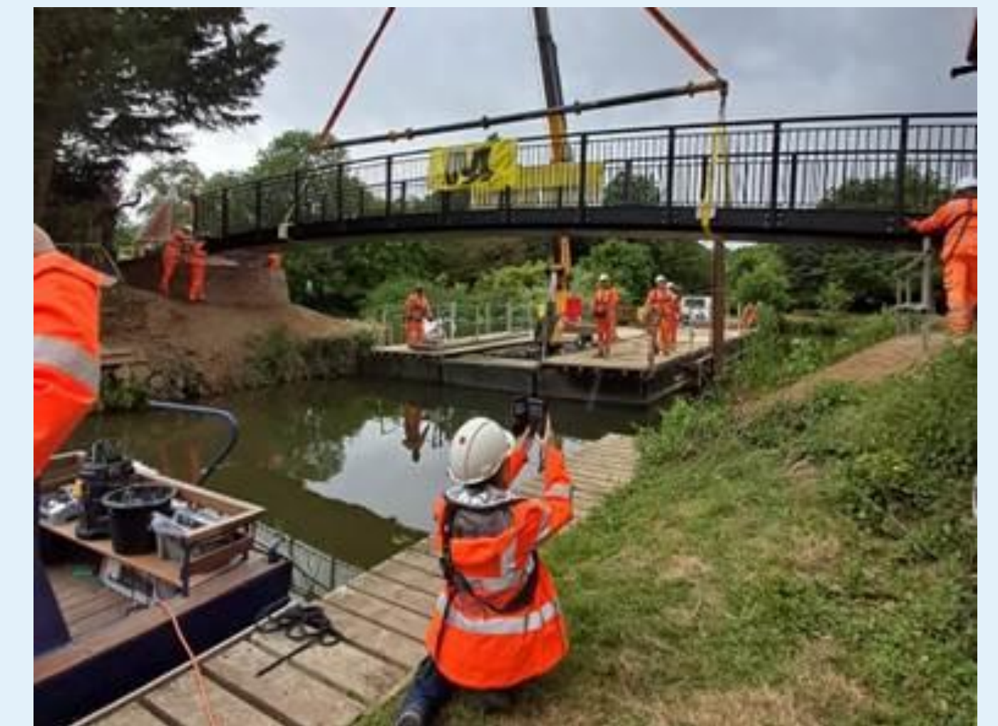
New bridge being lifted into position

The new footbridge forms part of the Medway Valley Walk and provides passage over the river entrance of Twyford Marina and significantly improves boat access to the marina.